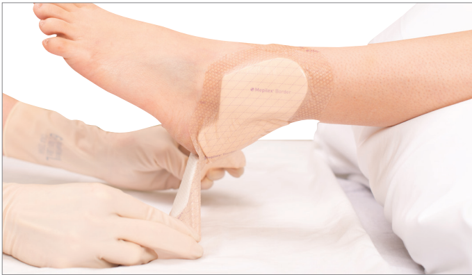
3. While maintaining the dressing position at the proximal edge of 'A' (see picture), perform assessment of the skin.