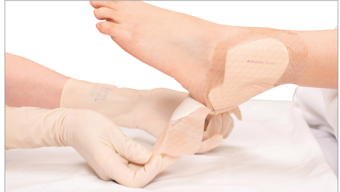
2. Continue to release the dressing from the skin using the handling tabs until the skin is exposed for skin check.