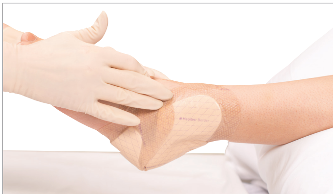
5. Confirm dressing is replaced to its original position, making sure the border is intact and flat.