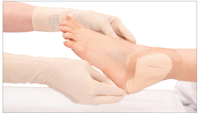
4. Re-apply the foam and border of the dressing. Make sure the flaps with the tabs are placed over the ankle flaps.