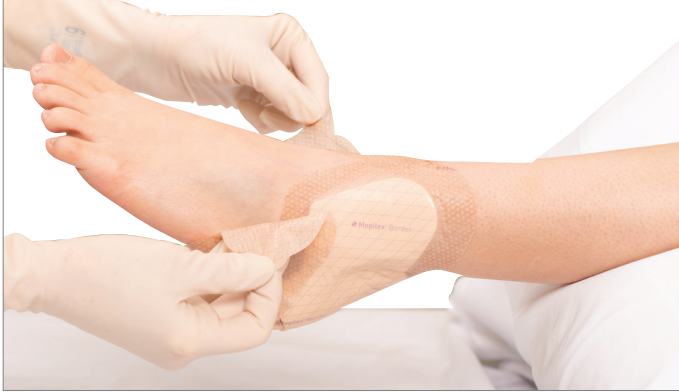
1. Gently pull handling tabs to release dressing from skin.