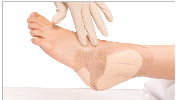
6. Press and smooth the dressing to ensure the entire dressing is in contact with the skin.